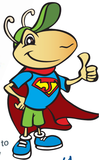
Jimmy Jimmy Jumper