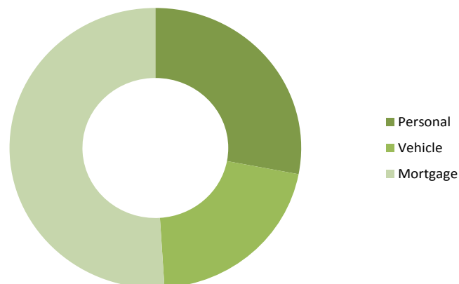
Edgar Wilson Trustee

The following loan types made up First Credit Union's lending as at 30 June 2015: